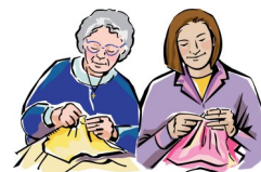
Prayer Shawl Ministry